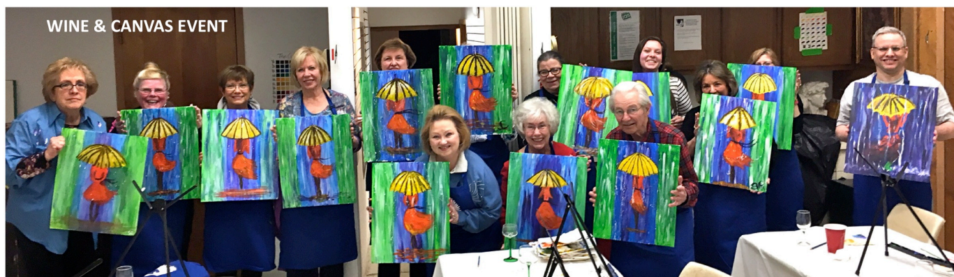
WINE & CANVAS EVENT