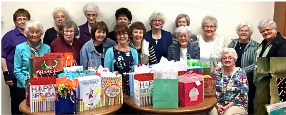
★ The GFWC Woman's Study Club of Litchfield collected "Birthday Bags" for the Meeker County Food Shelf.