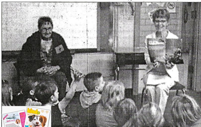
Second graders enjoy their new reading material.

★The Grant County Herald published a December article ★about GFWC Elbow Lake Study Club. . .