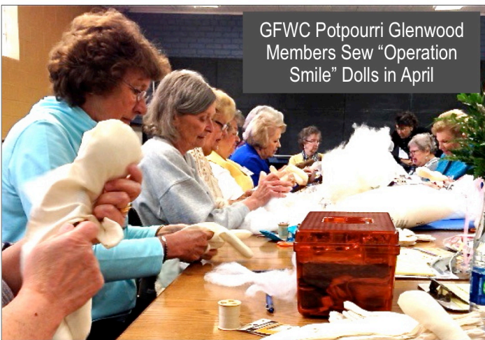
GFWC Potpourri Glenwood Members Sew "Operation Smile" Dolls in April

Darlene Femrite reports, "With mounds of white batting and needles flying, what better way to reunite after our three month winter break than sewing together and catching up with each other's lives!